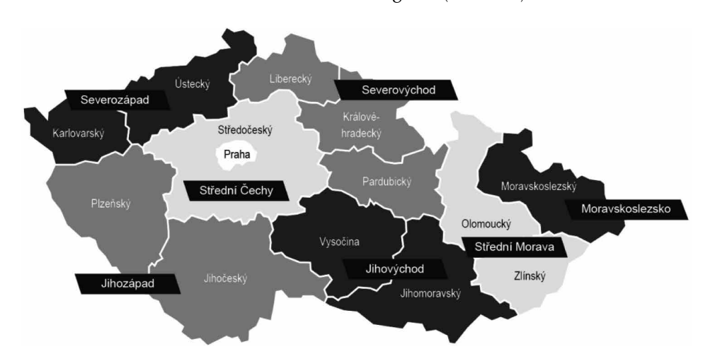
Map 1. Cohesion Regions in the Czech Republic. Established according to section 15 of Act 248/200 Coll. The map shows the 14 regions (NUTS III) and their relation to the 8 Cohesion Regions (NUTS II)