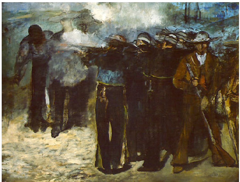
Figure 1 - VERSION 1 - Execution of the Emperor Maximilian , Version 1, Édouard Manet, 1867, 196x259cm, Oil on canvas, Museum of Fine Arts, Boston, A50846; Note nationality of the firing squad

In the first version, the firing squad is dressed in rebel republican uniforms of the Juárez Mexican army. Wilson-Bareau (1992: 61) argues that "the first, unfinished version was