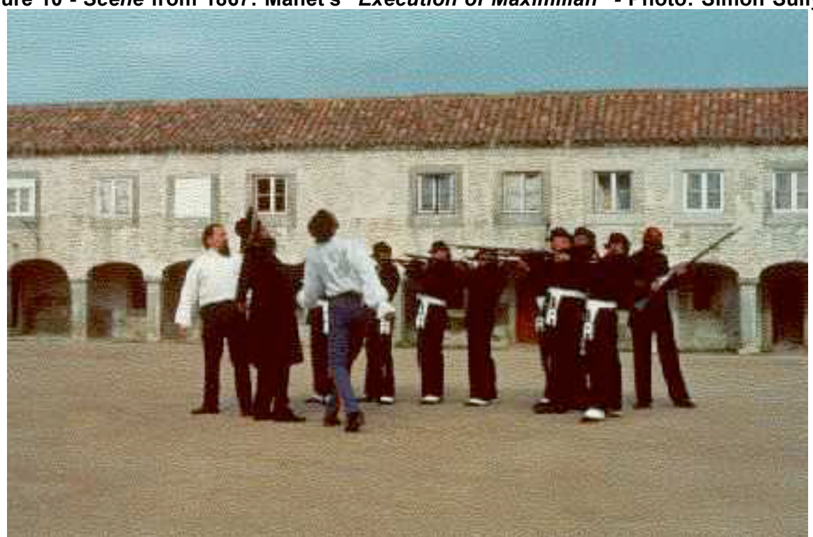
Figure 10 - Scene from 1867: Manet's "Execution of Maximilian"

This is a staging of the execution to give you an idea of what a staging of real could have looked like: