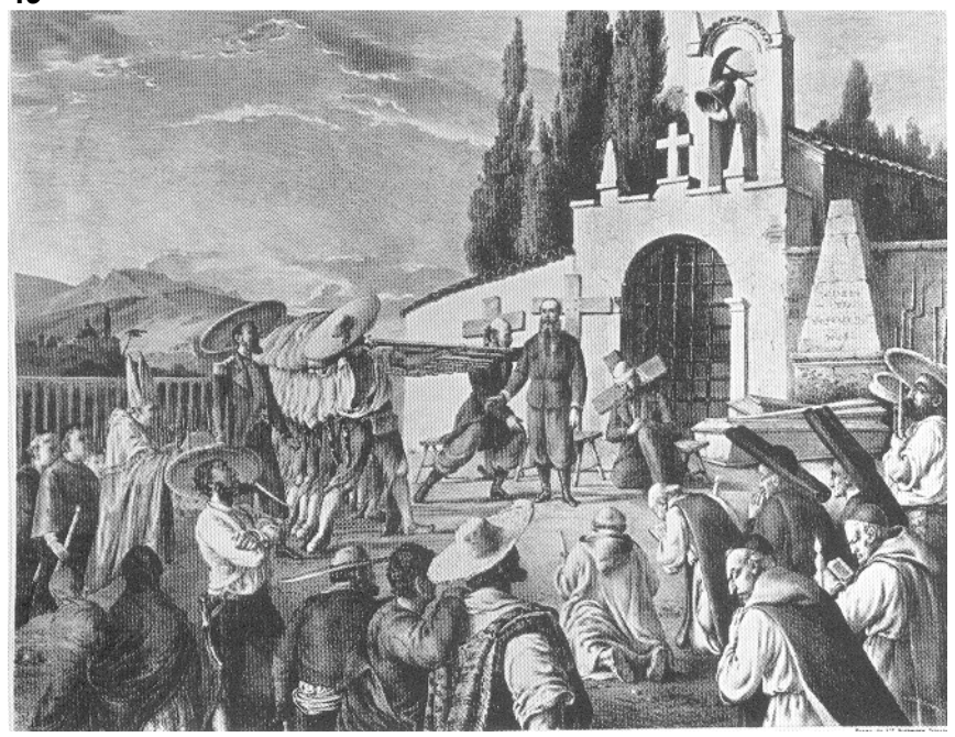
Figure 2 - Lithograph - The Execution of Maximilian, by Goineau -Source Wilson - Bareau, 1992: 49

The lithography by Goineau (above) is a romantic aesthetic, centering the attention and the viewing spectators (including the gallery spectator) on Maximilian, with spiritual narrative elements, such as congregates in