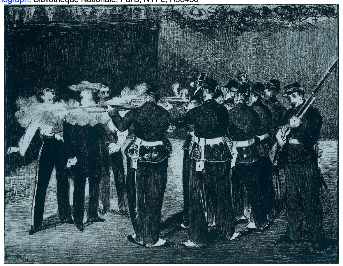
Figure 7 - Execution of the Emperor Maximilian , Edouard Manet, 1868, 33.3x43.3cm, Lithograph, Bibliotheque Nationale, Paris; NYPL, A98458