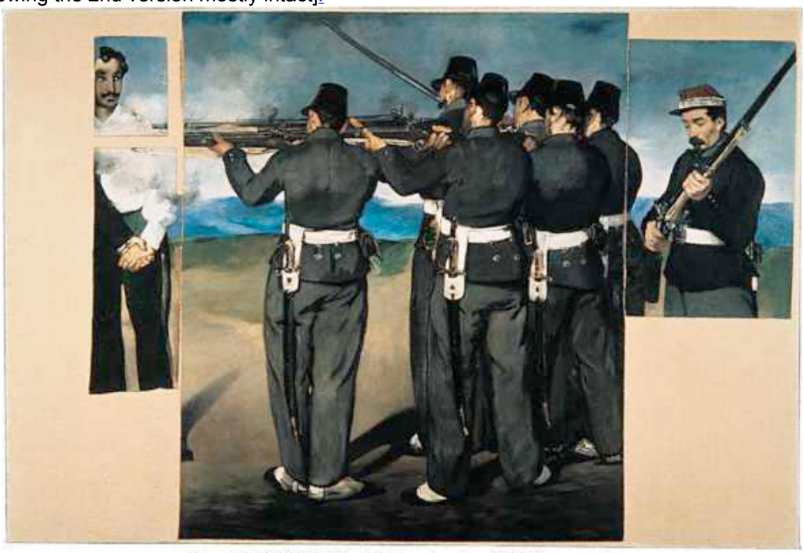
Copyright @ 2000 National Gallery, London. All rights reserved.

Figure 5 - Execution of the Emperor Maximilian , <u>Version 2</u> (fragments) Edouard Manet, 1867-68, Photograph by Fernand Lochard, c. 1883, National Gallery, London, CD#1155.058 [showing the 2nd version mostly intact].