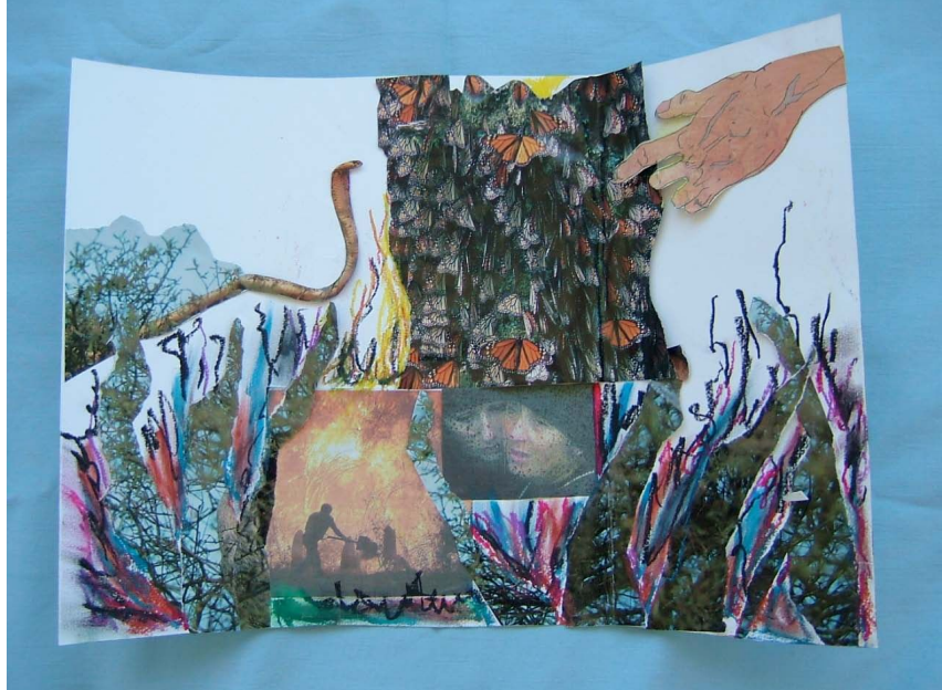
Participant C: Visual content/themes: (Figures 4a, 4b)