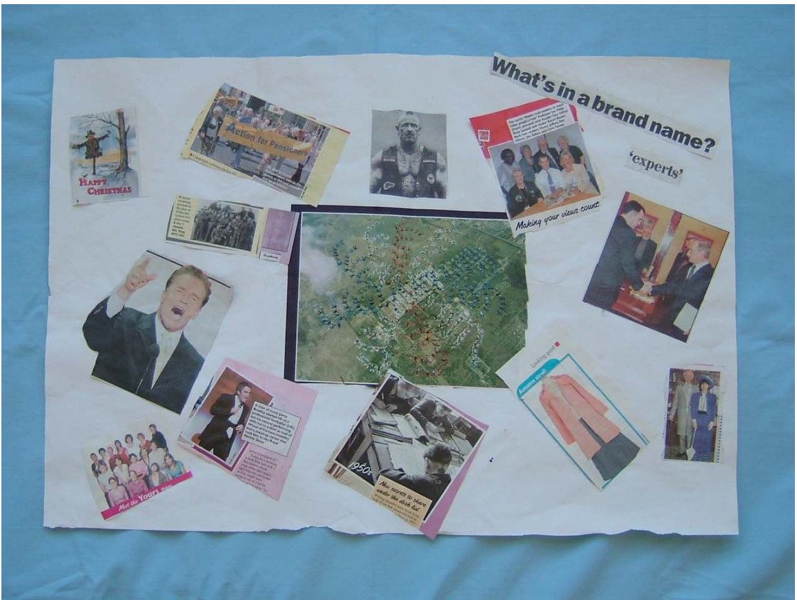
Participant E (Figure 6)

Commentary: The author of the image related the themes from his perspective as being about the organizational system (university) and the academy and the tension and conflict between the two. There were references to the hard work of keeping the organization running, the pressure of working with power issues around finances and personalities and time. A theme emerged of fear that the academy may be ruined by the demands placed on individuals by the organization. The participant shared an insight that the placement of the images revealed to him that he valued the academy and its ideals above the organization. The experience of this conflict was often strongly felt and the shower image related to a process of attempting to cleanse the 'bad' feelings generated by this conflict. Perhaps the unconscious material in this instance may be focussed on the pressures to maintain one area of work at the expense of another? Perhaps the ideals of the enterprise are under attack and could be seriously compromised or even destroyed? The image of a man impaled on a giant stiletto heel suggests violence and domination. These are visually strong and provocative images that may provide insight into the way the organization functions in its relationships and captures a flavour of potential problems in the system. Perhaps these powerful dynamics are not consciously owned and are therefore defended against in the system to detrimental effect?